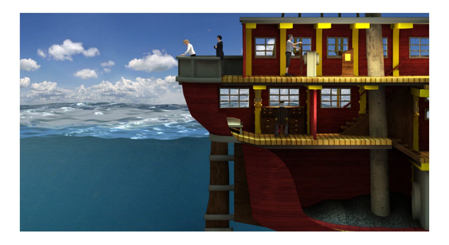
Gold Rush! Anniversary Free Download [Crack Serial Key